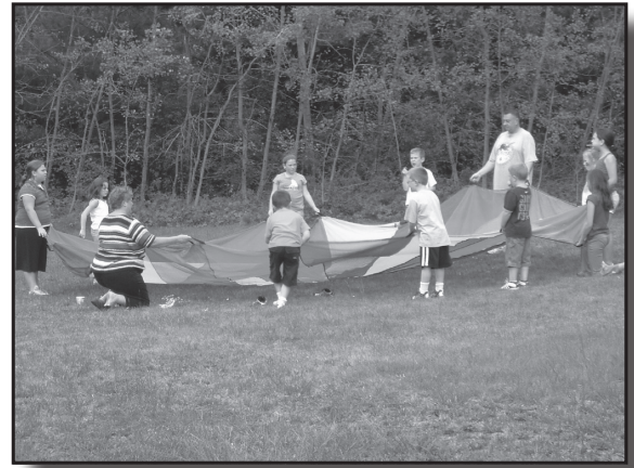
Family Fun Day.