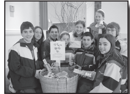
Children collect items for the Lenten Gospel program.