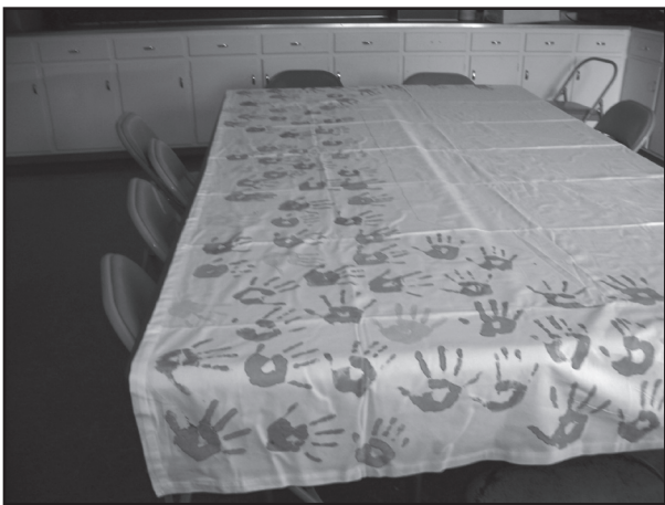
Altar cloth created by religious-education students.