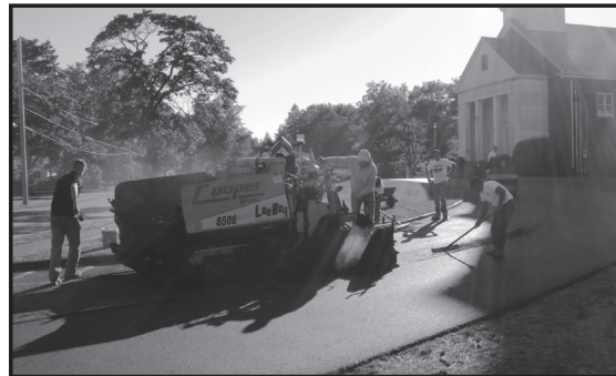
Repaving the parking lot.