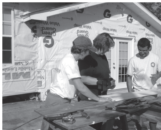
Parishioners help rebuild homes in Pass Christian, Mississippi.

Over Troubled Water and Lowell Women’s Shelter, as well as layette items for newborn babies of unwed mothers in the Framingham area. In spring, we held our collection of household items for Mission of Deeds. We also sent more than 16 boxes of new and gently worn shoes to Soles4Souls, which distributed them to