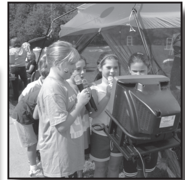
Family Fun Day.